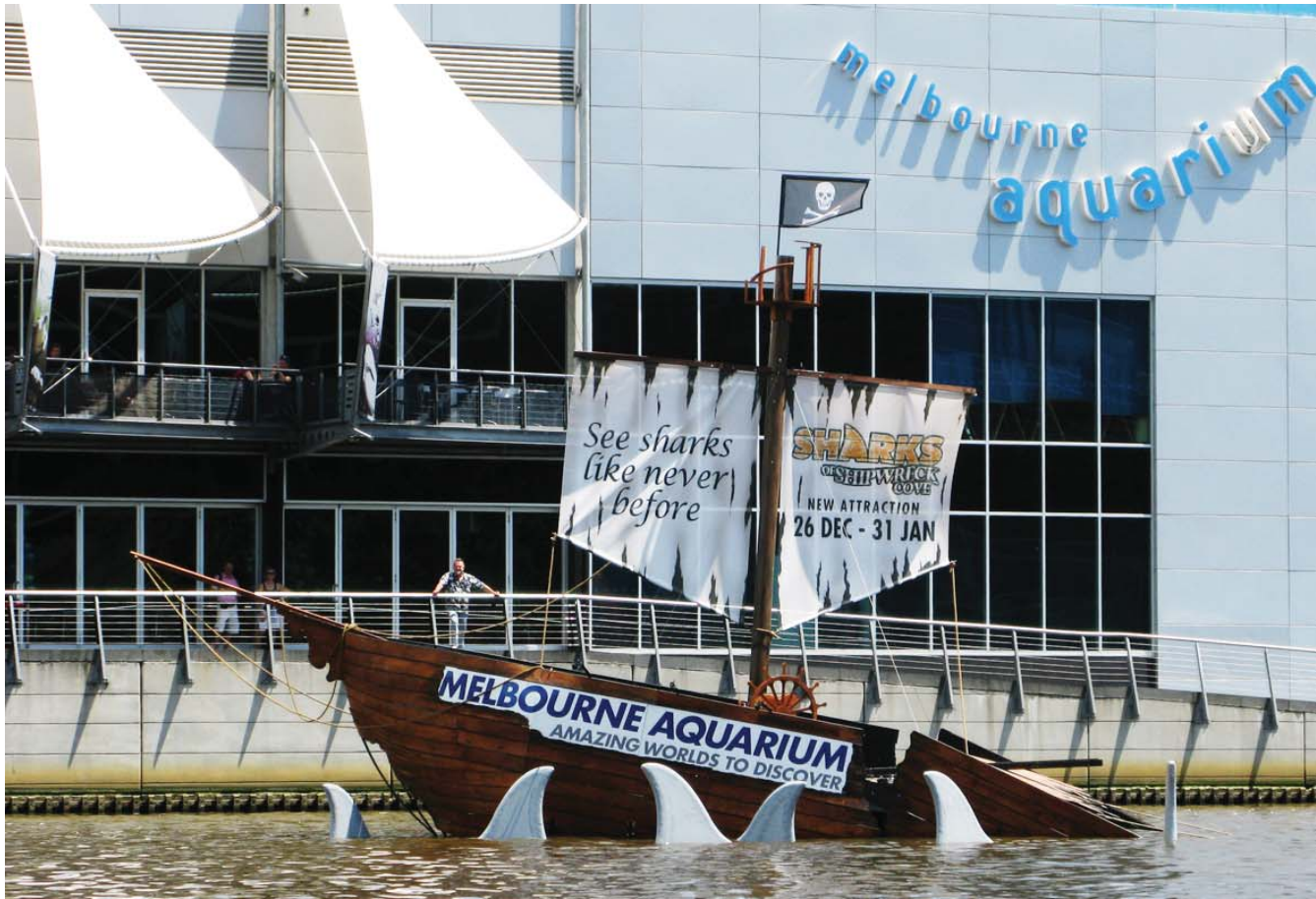
Melbourne Aquarium Sharks of Shipwreck Bay summer campaign marketing stunt Completion 2011 - 2012