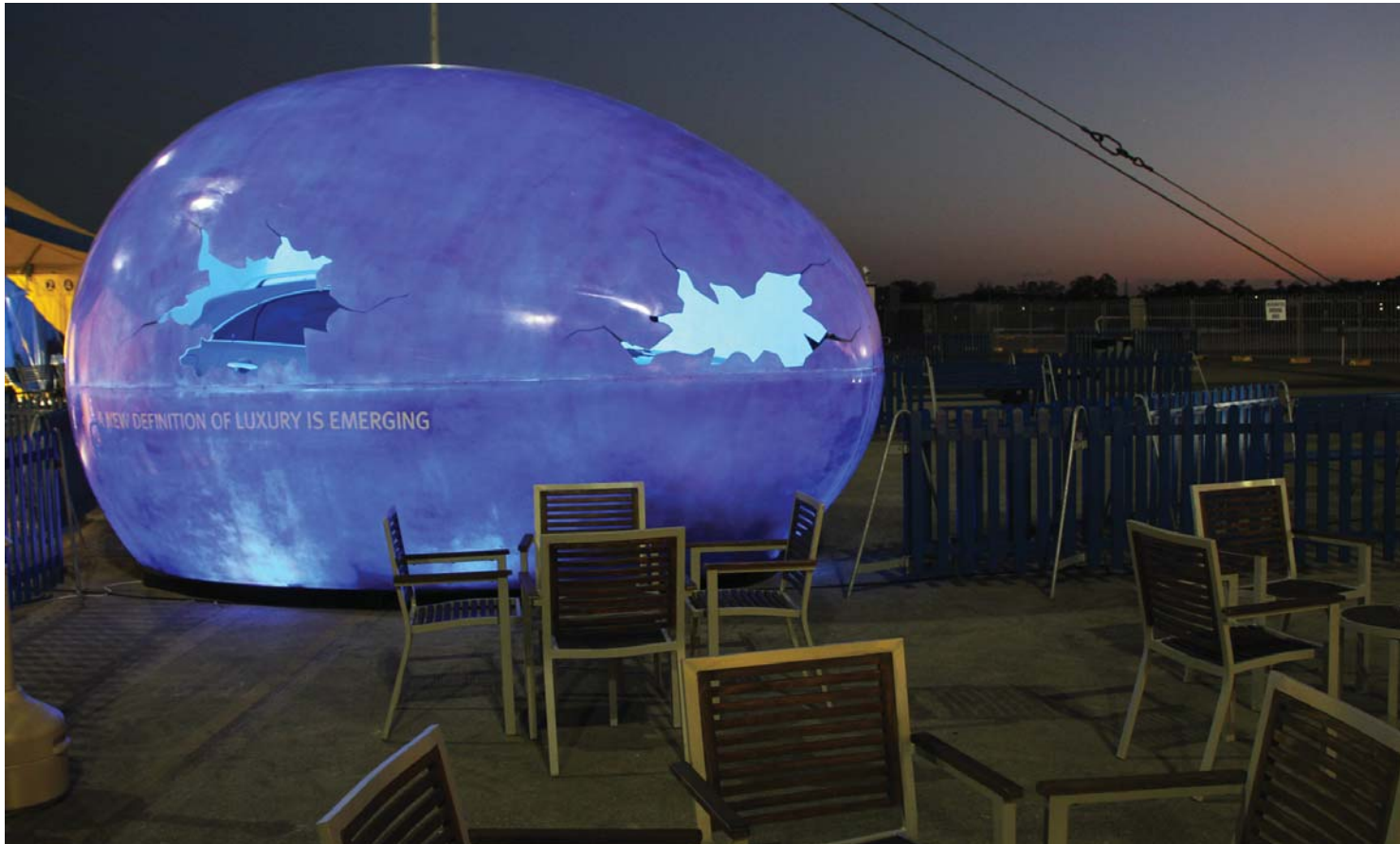
Infiniti Automotive Cirque Du Soleil Egg Display Completion 2012