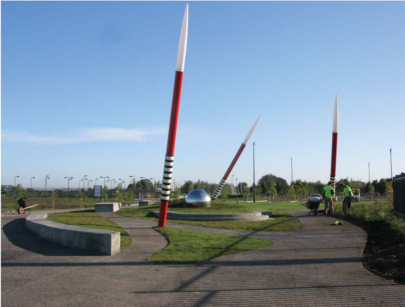
City of Casey Council Casey Fields Athletics Complex Public Art Completion 2011