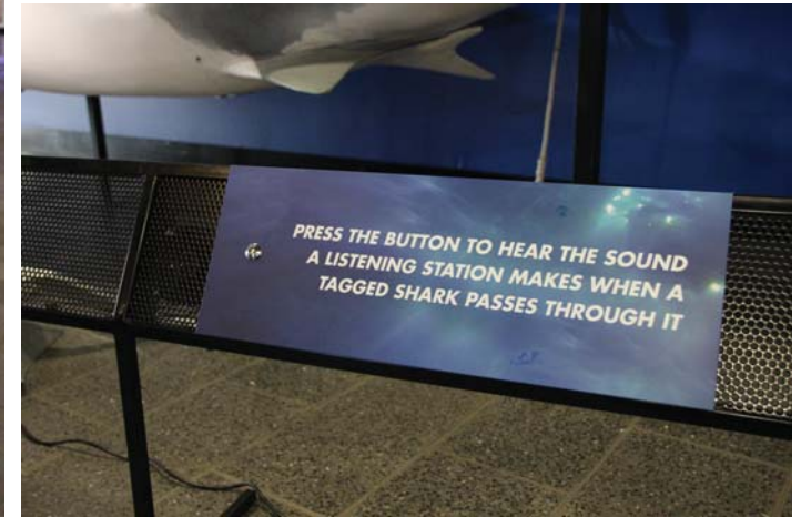
Melbourne Aquarium Public Entrance Display Completion 2012