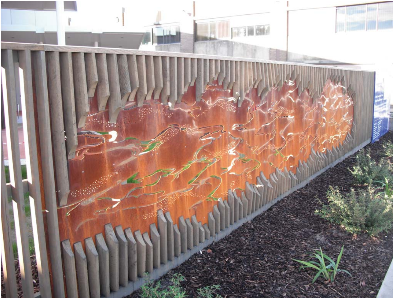
Latrobe Community Centre Morewell Public Fence Art Completion 2011 - 2012